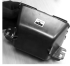
See pocket removed from panel

Remove the buttons (circled) from the old fascia and cut along the white line in order to remove the pocket from the panel itself.